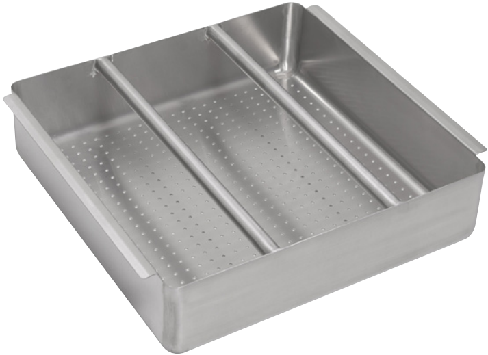
DISHTABLE PRE-RINSE BASKET