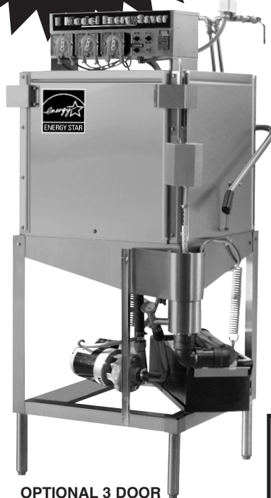
OPTIONAL 3 DOOR MODEL AVAILABLE FOR STRAIGHT AND CORNER OPERATION