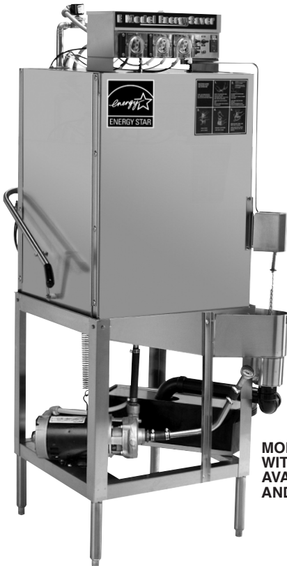
MODEL E EXT WITH 20-1/2" DOOR OPENING AVAILABLE IN STRAIGHT AND CORNER MODEL