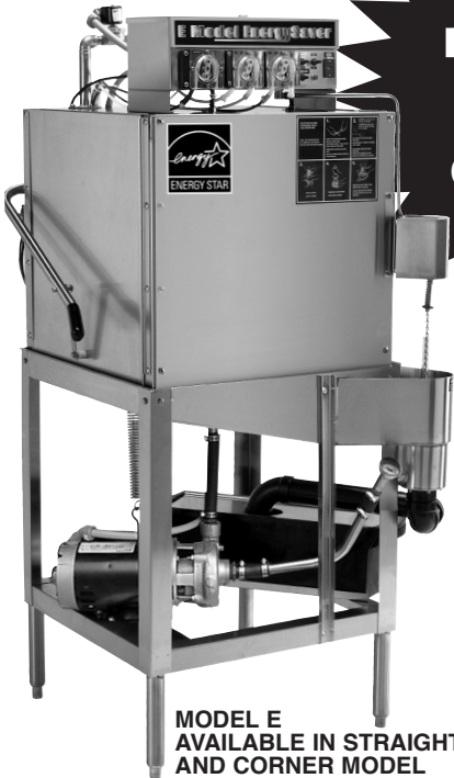
MODEL E AVAILABLE IN STRAIGHT AND CORNER MODEL

USES ONLY 1.01 Gallons Of Water Per Cycle!