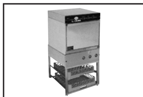
The optional Universal Pedestal has a storage feature for spare dishracks, with the ability to store two empty dishracks beneath the machine. 15-1/4"H X 24"W X 25-1/4"D.