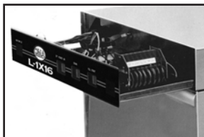
"Work-in-a-drawer", may be removed.