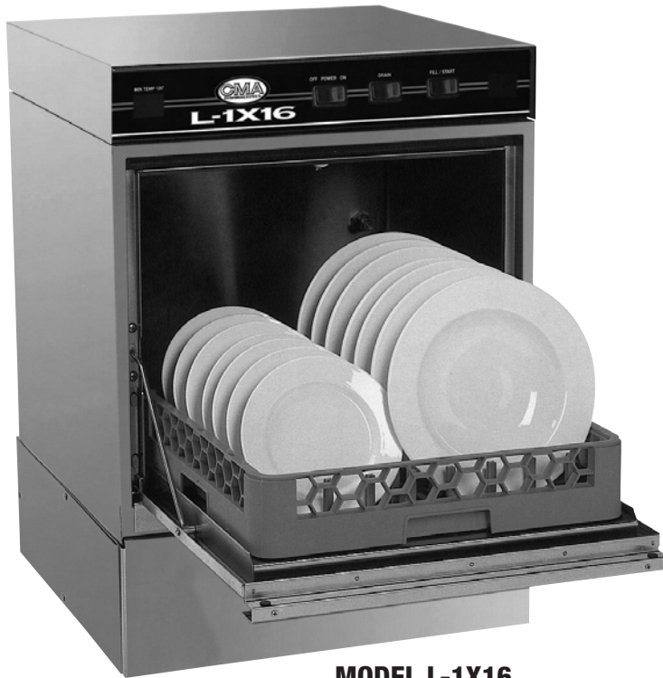
MODEL L-1X16 Door Opening 16" Legs not included

Chemical Sanitizing Undercounter Dishwasher