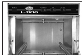
Upper and lower rotating wash arms guarantee excellent results.