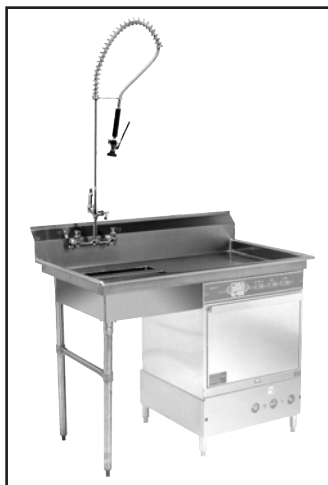
Optional dishtable and Pre-wash.