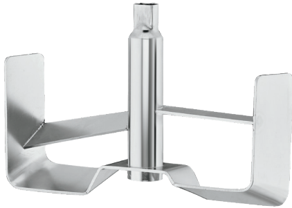
WCIC25PDL Heavy-duty stainless steel paddle