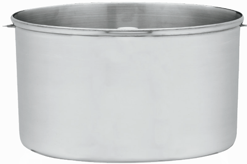
WCIC25BWL Removable aluminum batch bowl